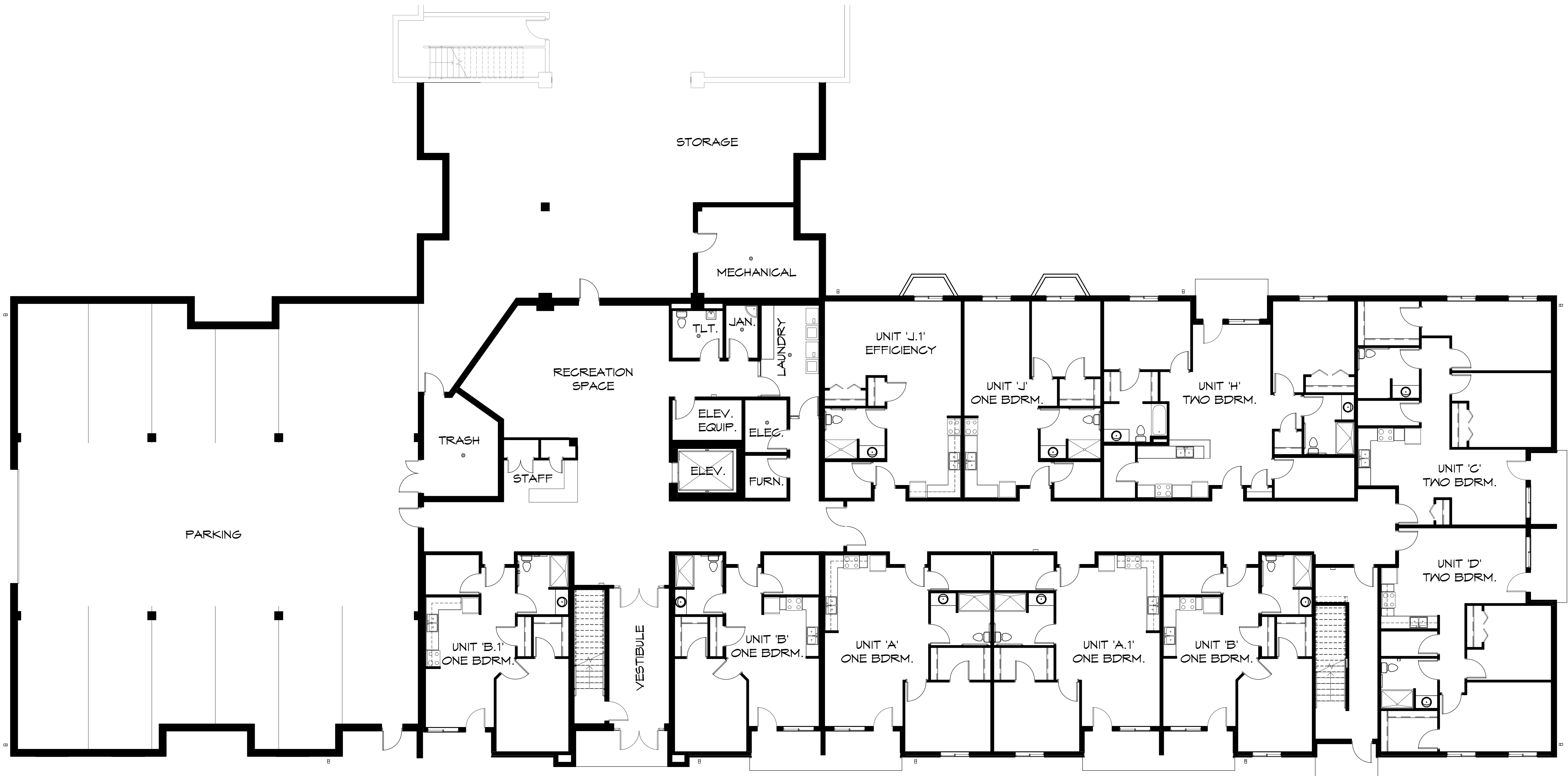
GARDEN FLOOR / 1ST LEVEL SCALE: 1/8" = 1'-0"